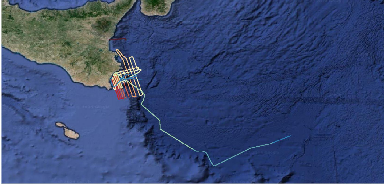
Fig. 1: Map of the survey area in the Ionian sea, showing the fiber optic in red and the ship route in different colors which identify different segments of the survey

During the M199 Meteor cruise (25 February–11 March 2024) in the Ionian Sea, high-resolution multichannel seismic data were acquired using a sparker source, with PAM/MMO operators continuously monitoring for marine mammal presence.